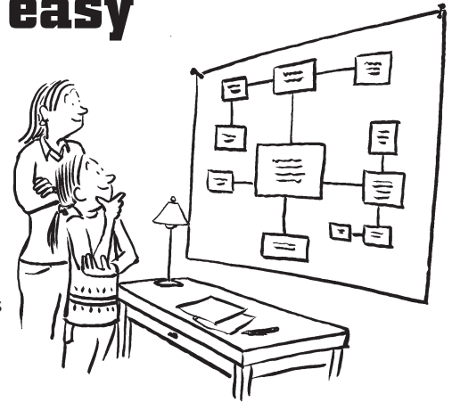
diagram into paragraphs. The opening paragraph should contain her main idea, and the first sentence of each subsequent paragraph should come from one of the subtopics in her plan. Then, she can fill out each paragraph with facts from the small boxes.

Your child can write her paper logically by converting the ideas from her