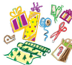
Gingerbread House Gifts

Students will be shopping at our Gingerbread House Monday-Thursday, December 16-19th. This event allows our students to select gifts for their family members at a minimal cost and surprise their loved ones. Adult help with shopping and bagging is needed. Please use this link to volunteer